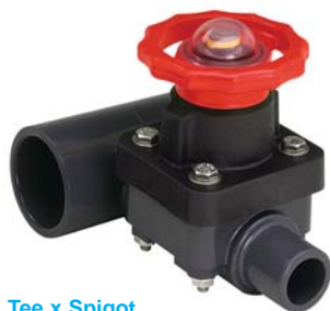
Tee x Spigot